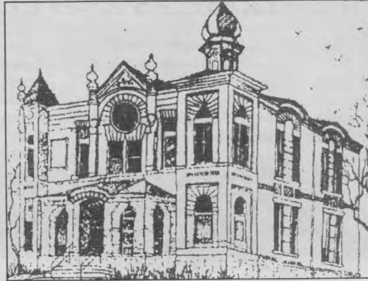
Temple Aaron, Trinidad, Colorado, built in 1883.

I am looking forward to next years Memorial Day Trip!