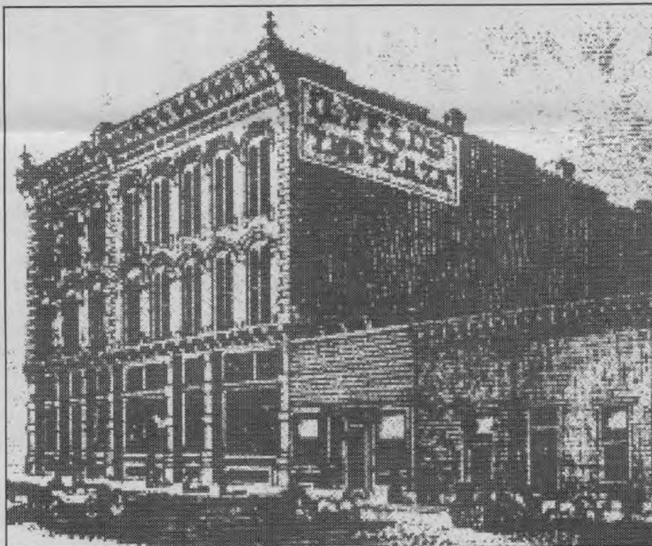
Ilfeld's department store on the Las Vegas plaza. The painted sign, now much faded, can still be seen today.