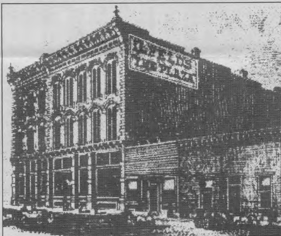
Ilfeld's department store on the Las Vegas plaza. The painted sign, now much faded, can still be seen today.