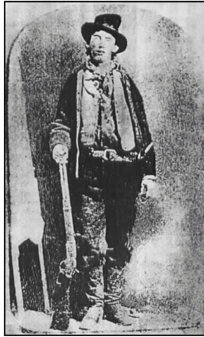
Billy the Kid—he wasn't Jewish, but...