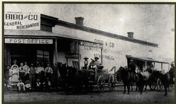
Bibo Store, Bernalillo, N.M., Ca. 1903

Founded in 1985, the New Mexico Jewish Historical Society is 501(c)(3) non-profit organization.