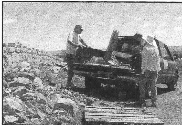
NMJHS volunteers rebuild a cemetery wall.