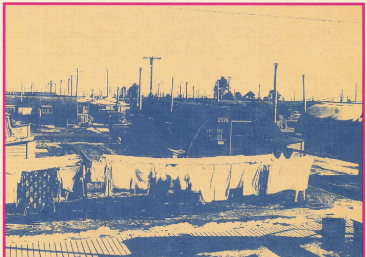
DOMESTIC SCENE: Laundry day, 1942, during Manhattan Project, looking east with Sangre de Cristo Mountains in background. Quonset huts were located where today's Central Avenue and Iris Street Apartments are.